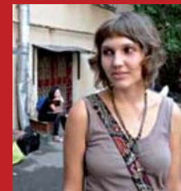
Playwright Yekaterina Pulinovich