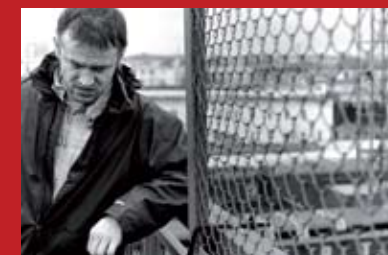
Playwright Vasily Sgarav